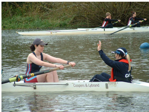
Attention! . . . A new season about to get underway, with Catz women lining up against Merton at the start of Autumn Fours.

Back in the present, there is an update our current standing relative to the 35 other College Boat Clubs, news of major alterations to the format of the 2015 Boat Races, and a message from the chairman about changes to the Rowing Society finances.