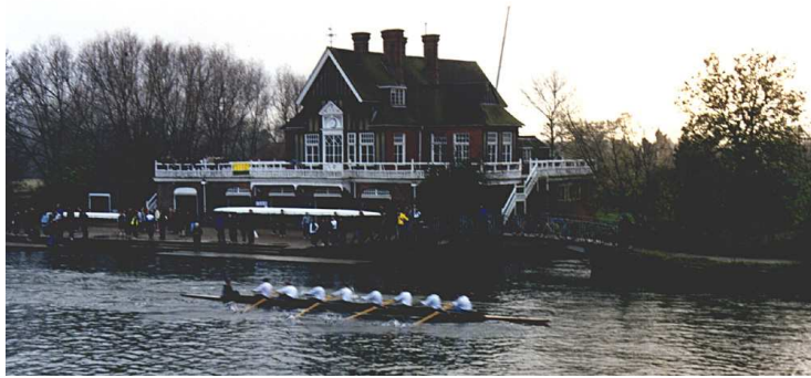
The old OUBC boathouse (1882–1999).