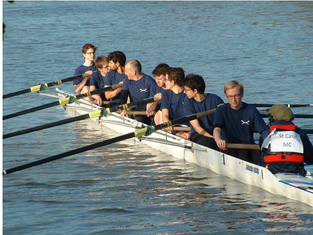
Men's Novice B crew