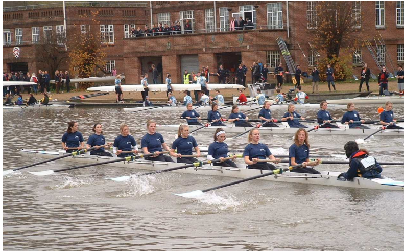
Women's Novice A (nearside) racing Keble A in Christ Church Regatta.

always in Michaelmas, on getting back on the water after the long summer away and, more importantly, on supporting the Lower Boats' Captains (LBCs) as they trained up the novices.