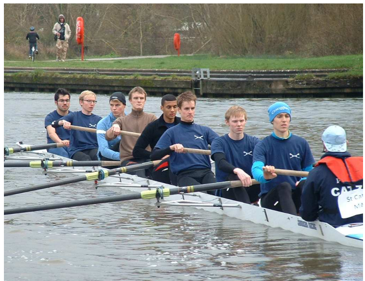
Men's Novice A crew