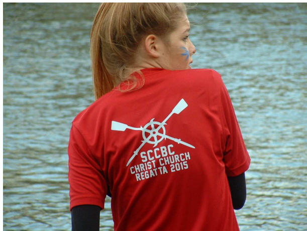
This autumn's colours are . . . red and white, apparently.