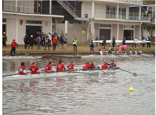
Women's Nov C having a spot of bother during racing.