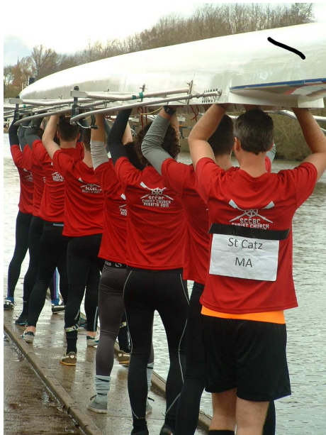
Men's Nov A boating for Christ Church Regatta

Our novice squad had a great intake and they are looking very promising. We are hoping that about 15–18 of them will continue in the senior squad. After Wallingford head the novices joined the seniors and we had some mixed outings to prepare them for the January training camp.