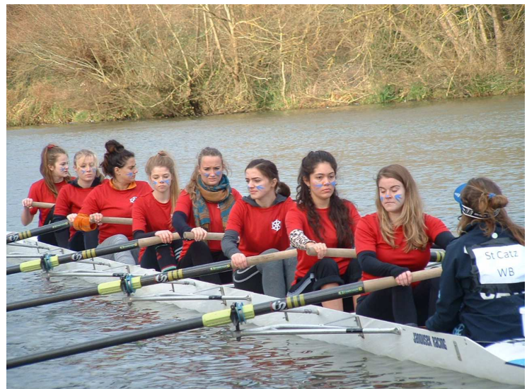
The Women's Nov B crew preparing to race