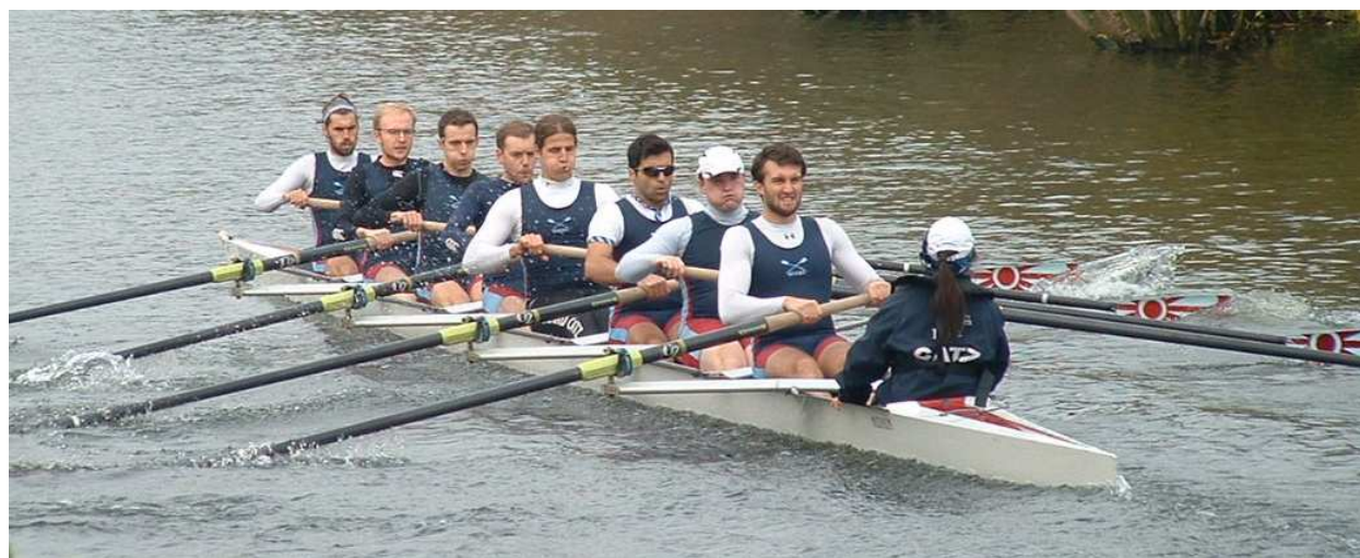
Catz senior men racing in IWL-A

So then one looks to the novices. Two VIIIs raced at total of 6 times in Christ Church Regatta. Unfortunately, the only time they crossed the finish line first was when their opposition failed to show up. But, to put that in context, in the past 5 years Catz women have had 20 races in Christ Church Regatta and only once (in 2013) did a Catz women's novice VIII actually beat their opposition fair and square. More of the same next year, or is it perhaps time to try something different?