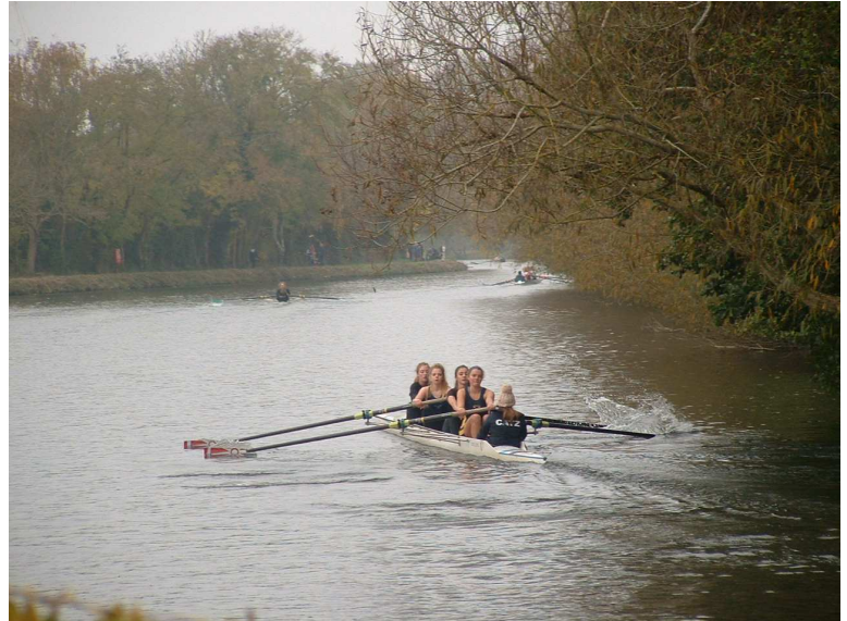
Catz women racing in IWL-A

The Fours Head results provide some early indicators for the Boat Races and finally, as we reach the end of the year, we review the current standing of the Boat Club.