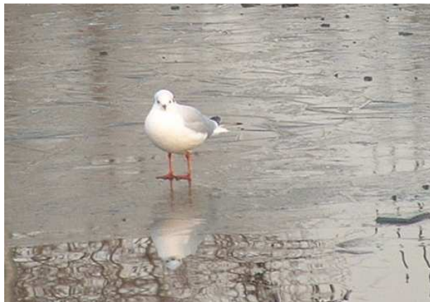
Icy Isis. Fortunately, only for one day, in 9th week, after everyone had gone home.