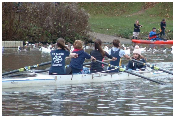
Catz Women's IV racing in IWL-B