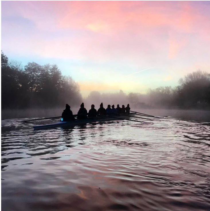
An inspirational image of the senior women embarking on a dawn outing ...