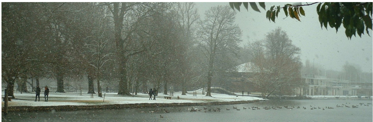
The Isis this morning: Oxford's first significant snowfall for several years (but term ended a week ago).