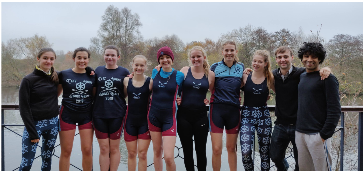
Winners of the Women's Senior VIII's in Nephthys Regatta

*'Friendly' crew — ineligible to proceed