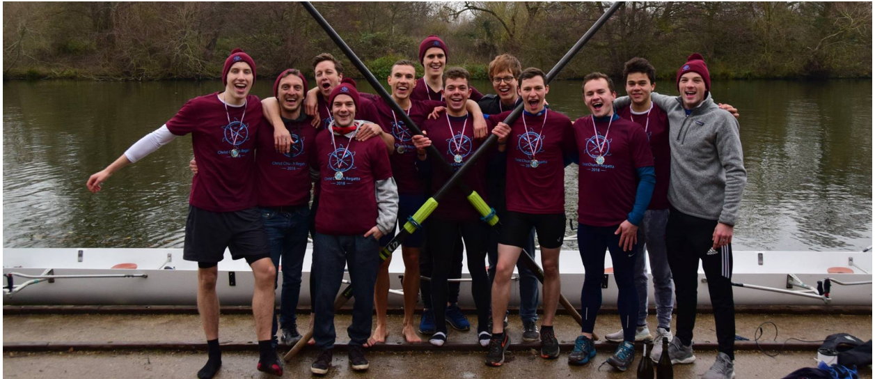
Winners of Men's Novice VIIIIs in Christ Church Regatta