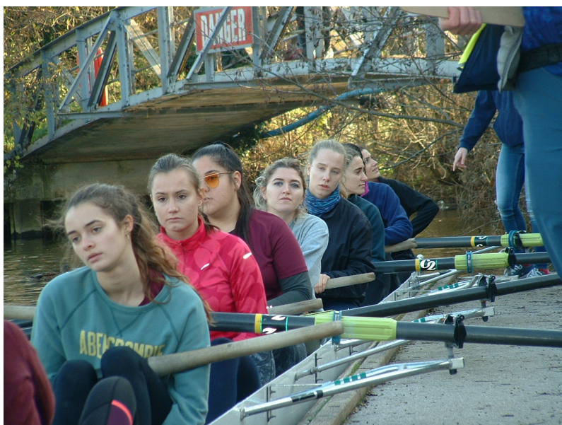
The women's novice VIII in Nephthys Regatta