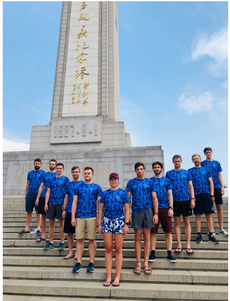
Just your average bunch of tourists taking in the sights in the People's Square in Nanchang. Wait — I hope those aren't dark blue t-shirts?

Aside from rowing in the regattas in Nanchang and Yangzhou, the Catz men also took part in multiple indoor erg competitions, most notably one in the centre of a shopping mall in Nanchang, where there was a 500 m sprint and two 8×250 m relays, one with the public involved and one without.