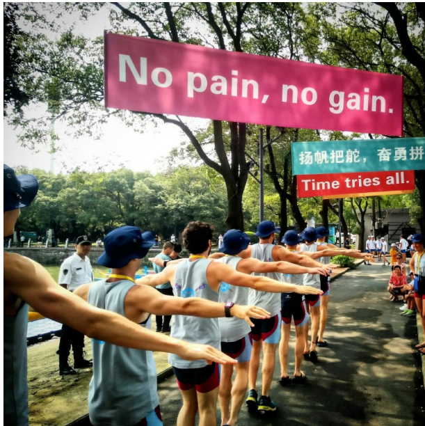
Different continent, different culture — same old message. The Catz crew warming up before racing in Nanchang, China.