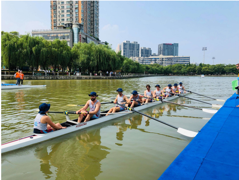
Nanchang: Catz boating for the 1 km heats.

Between Nanchang and Yangzhou the team enjoyed visiting multiple museums and tourist sites, such as Nanchang People's Square or the Pavilion of Prince Teng, to learn more about Chinese culture. We were also afforded the opportunity to present what life is like rowing and studying at Oxford to school children at a local school in Nanchang, whilst also getting them to compete in a friendly erg competition in mixed crews of the school children and university students. Not only was the trip educational but it was also thoroughly enjoyable and we hope to be invited back soon.