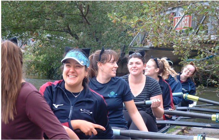
Just happy to be racing again. The Women's VIII pushing off for IWL-A, Catz' first race of the season.