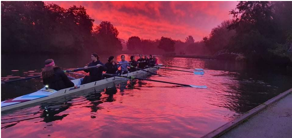
No matter how you dress it up, an early morning outing is still an early morning