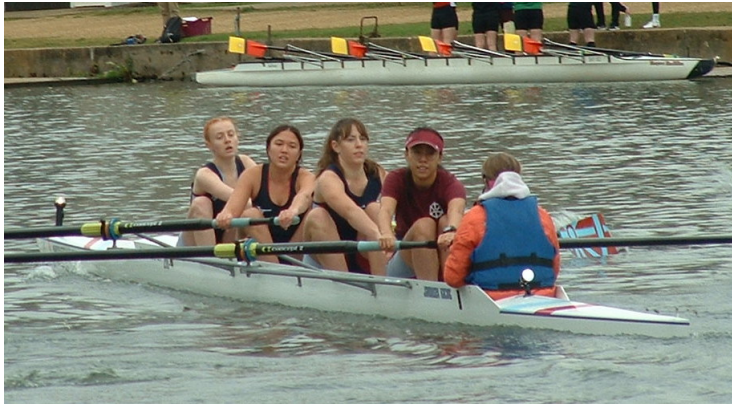
The Women's IV racing in Nephthys Regatta