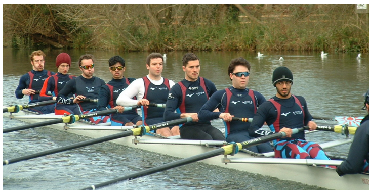
The men's Senior VIII racing (top) in Nephthys Regatta and (bottom) IWL-B