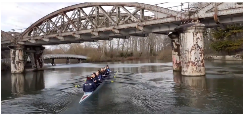
Catz end-of-term outing below Iffley Lock