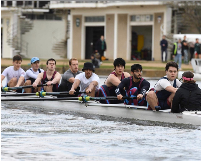
The Men's Senior VIII racing in Nephthys Regatta

We also had a reasonable novice intake, with several very committed athletes and a fair amount of physiological potential. The novice squad showed rapid improvement under the direction of our Lower Boats Coach, losing to eventual finalists at Nephthys Regatta. Unfortunately, at the Michaelmas Novice Regatta (in lieu of Christ Church Regatta), a combination of injury and illness necessitated the entry as a 'friendly crew', though this performed well until racing was stripped back due to stream conditions.