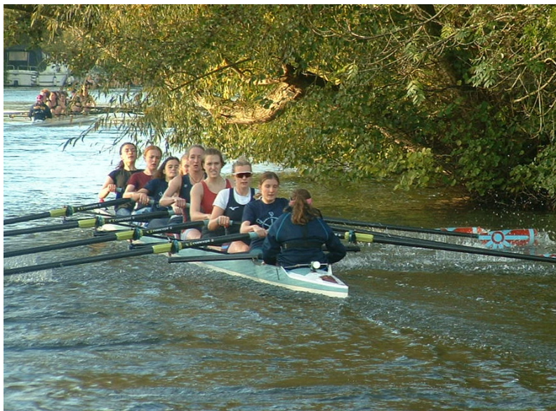
The Women's Senior VIII racing in IWL-A.