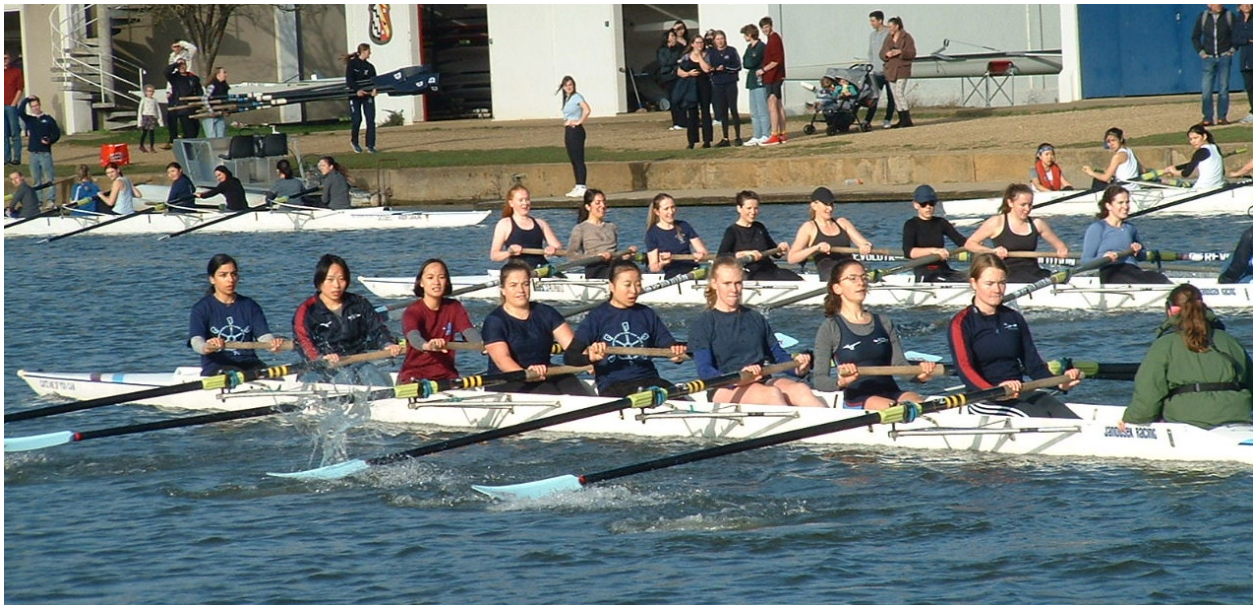
The Women's Novice VIII racing in Nephthys Regatta.