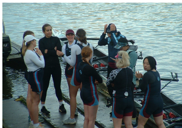
The Women's Senior VIII, after racing in last weekend's Isis Winter League A.

There will also be news of the University crews. I believe there is at least one Catz triallist but I'm waiting until they publish the squad lists to see if there are any others.