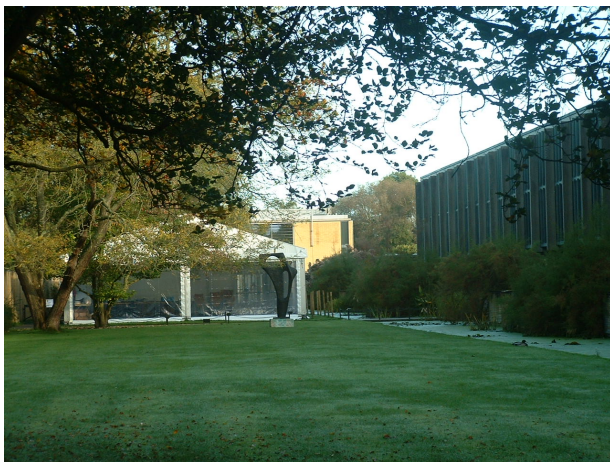
Michaelmas term started with the unwelcome sight of tents once again parked on our lawn.