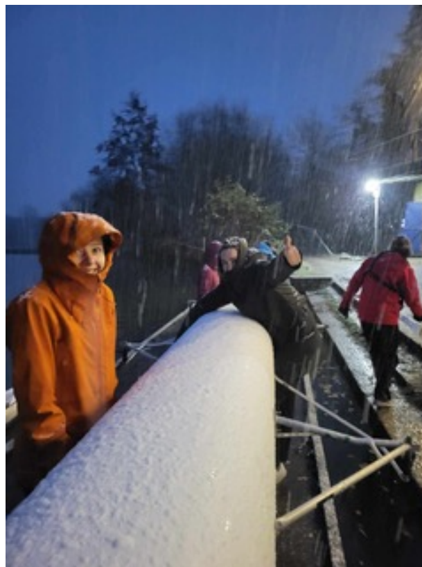
A Merry Christmas and a Happy New Year to all our readers.