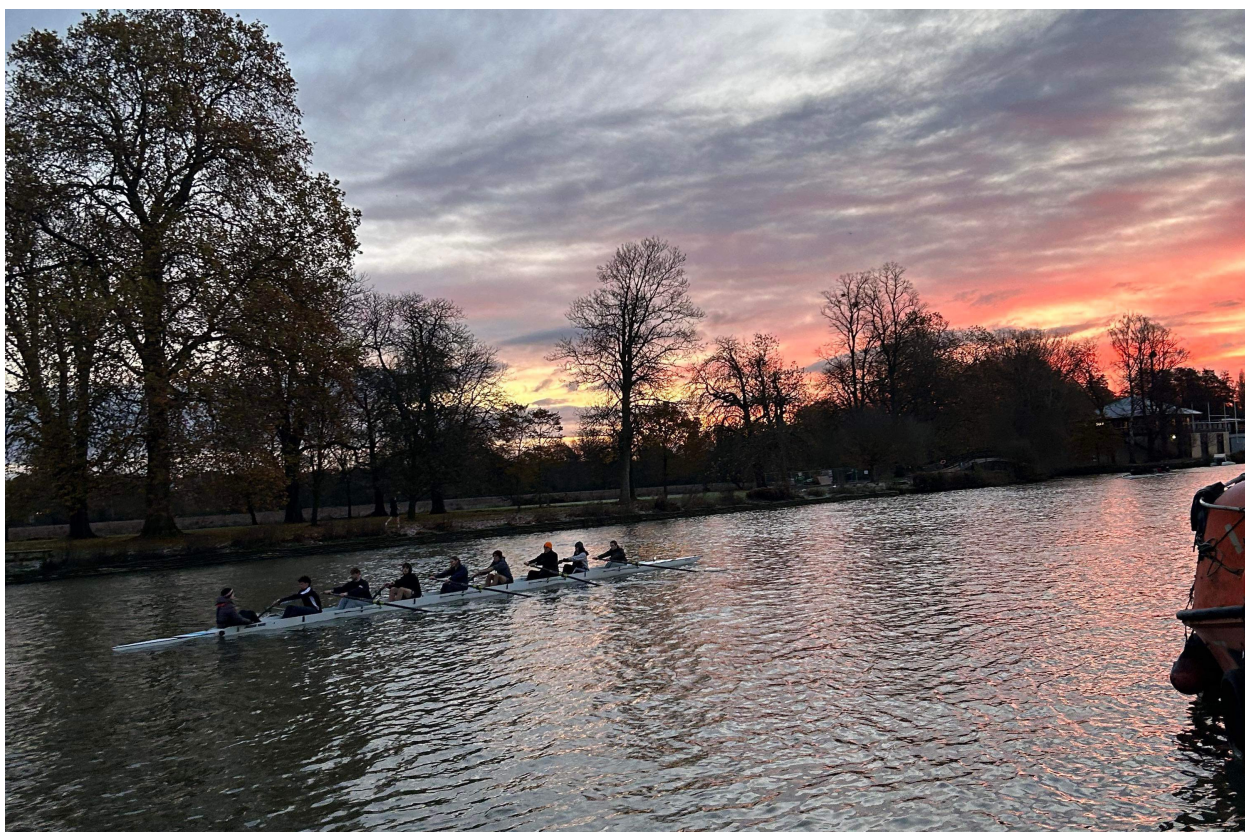
How we like to portray early morning outings ...