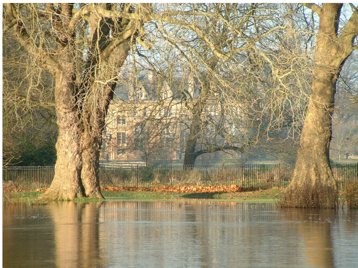
The fog lifts to reveal the Isis encroaching on Christ Church Meadow.

Then, at the end of 6th week, came Storm Bert which (who?) pushed the Isis back up to Red Flag and the resulting cancellation of the Tamesis (formerly Christ Church) Novice Regatta and IWL-B. Thus a term passes without a single Catz oar being pulled in anger. The Captains provide their reports.