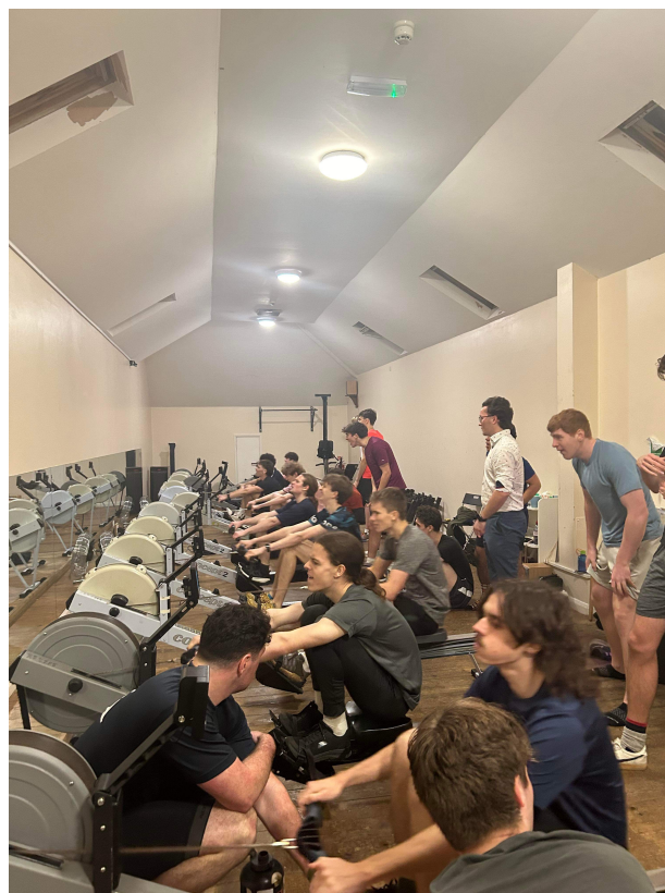
Fun times upstairs in the boathouse