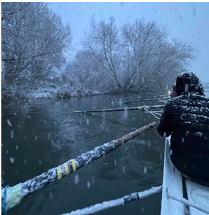
and maybe we'll downplay the risk of mornings like this

This was done in two waves. For the first wave of taster sessions, we carried out tank sessions, while for the second wave the weather allowed us to have a water session. We only have 5 returning seniors, given that many of last year's squad graduated.