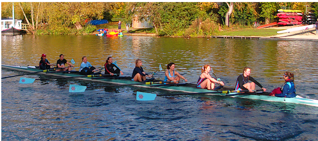
The women's VIII racing in IWL-A