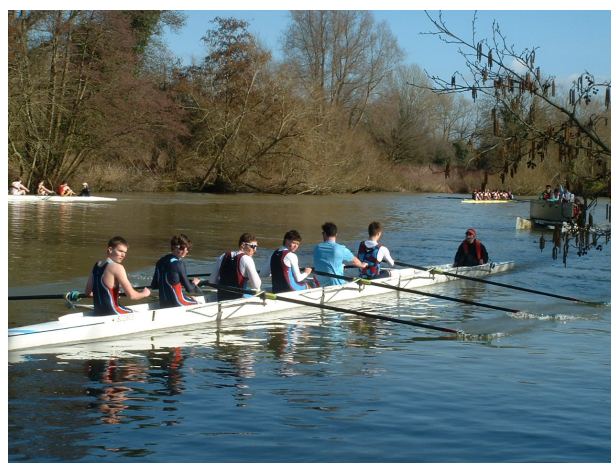
A numerically-depleted Men's 1st Torpid returning to the boathouse following their klaxoned race on the Saturday.

In summary, another disappointing year. The men's 1st VIII are at their lowest position since the 1980s and the women 1st VIII at their lowest position ever in Eights, and just one place above that in Torpids.