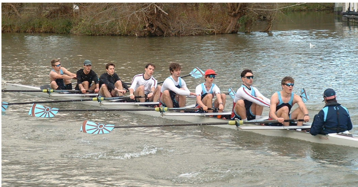
The Men's Senior VIII racing in IWL-B.