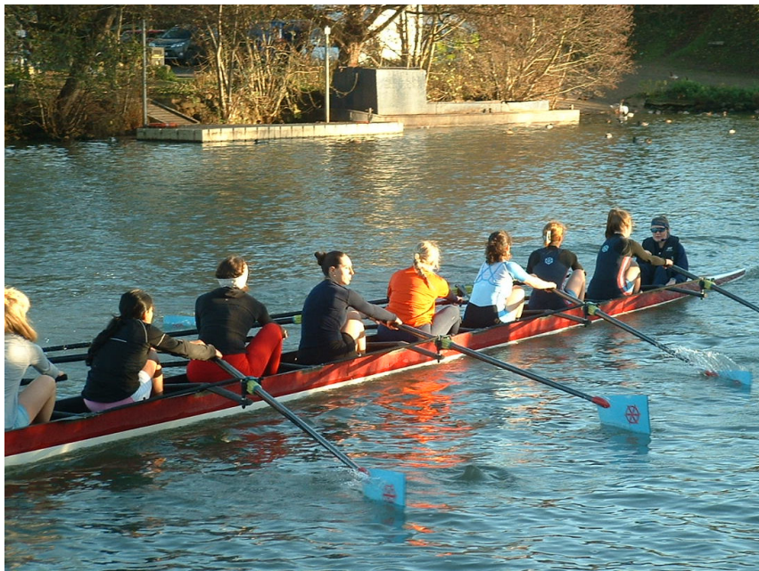
The Women's Senior VIII racing in IWL-B.

The novice recruitment was a huge success this term, and the commitment from the novices paid off, with some impressive individual results in BUCS beginner indoor regatta 1k (including 3rd, 5th and 6th), backed up by a few senior athletes in the 2k. The highlight of the novice women's term was beating 4 crews to reach the semi-finals of Tamesis Novice Regatta, the furthest Catz women have gotten since 1998!