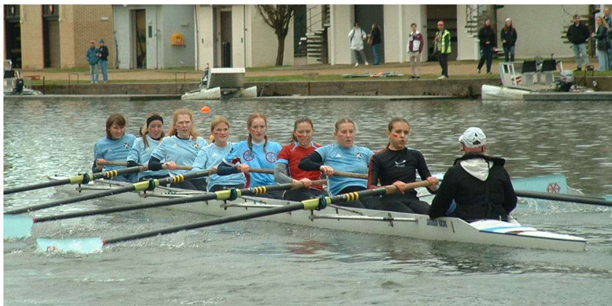
The women's Novice VIII racing, with a fair degree of success, in Tamesis Regatta.

1st 4:26.0 Wolfson MA 1st/23 M8 16th 5:08.0 St Catherine's MA 16th/23 M8 25th 5:23.5 University WA 1st/11 W8 43rd 6:17.5 St Catherine's WA 7th/11 W8