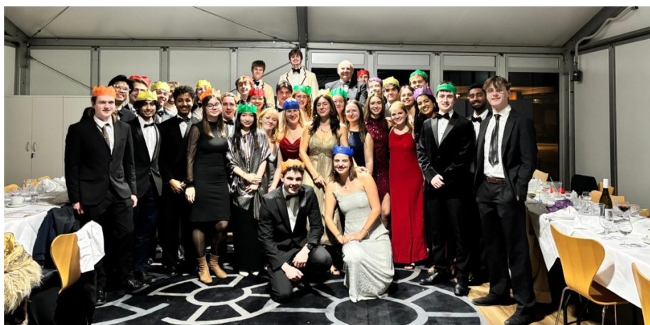
The Boat Club Christmas Dinner, in the temporary dining 'shed'