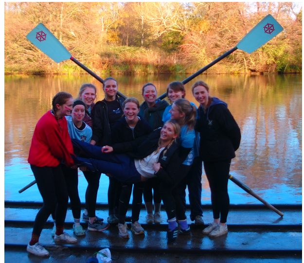
The Women's Novice VIII.

The end of term finished with a lovely Christmas dinner and commitment from all the boat club members to a 'Christmas Miles' challenge to keep us strong for next term.