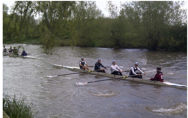
St Catz men closing on Wadham in City Bumps at the start of term (Photo: Peter Morgan).