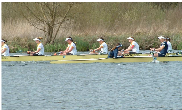
The Osiris cox counting off Blondie oarswomen in the only one of this year's University Boat Races where both crews were still in the same frame approaching the finish.