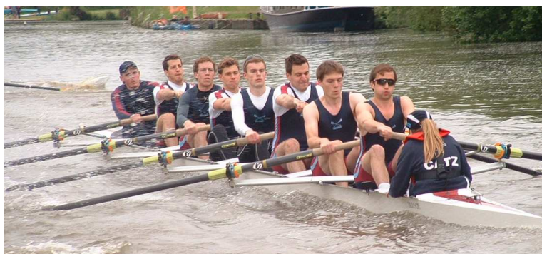
Men's 1st Eight racing on the Friday

In 7th week, representatives of the Men's Squad joined the women to get through one round of Mixed Eights at Oriel Regatta.