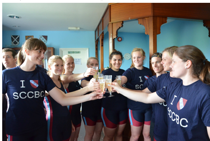
Women's 1st Eight after their final race