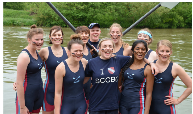
The Women's 2nd Eight, Catz' most successful crew of 2014

19 Jul 2014 London Drinks, Founders Arms