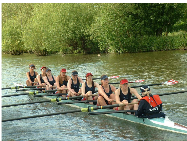
... and the new boat in action, one week later, during Eights.

Thanks also to Poppy Lambert, last year's women's captain, for overseeing the whole process.