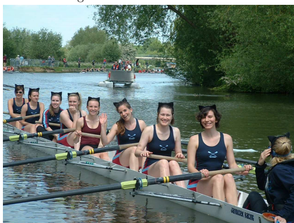
The Women's 3rd Eight, with a relaxed start to the week as the bottom boat in the bottom division.