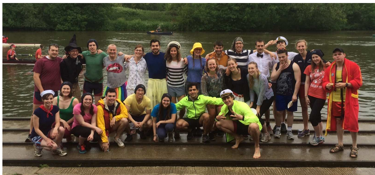
The St Catherine's College Boat Club entries for the Mixed VIIIs event in the (rainy) end-of-term Oriel Regatta

www.facebook.com/group.php?gid=93221115264