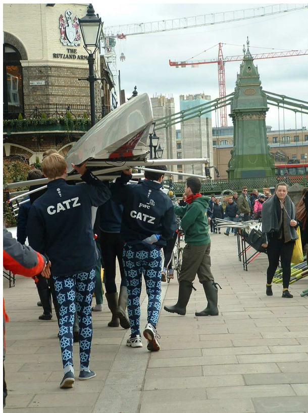
Catz men boating for the HoRR at Hammersmith

been raising eyebrows this season, defeating Oxford and causing Cambridge serious problems in their Boat Race warm-up fixtures. Starting 3rd, Brookes passed Molesey and closed 9 s on Leander to register their first HoRR win (and their 2nd boat finished 4th). The Oxford Blue Boat are going to have their work cut to reclaim the title of fastest club crew in Oxford, but from there it seems but a small step to being the fastest in the country.