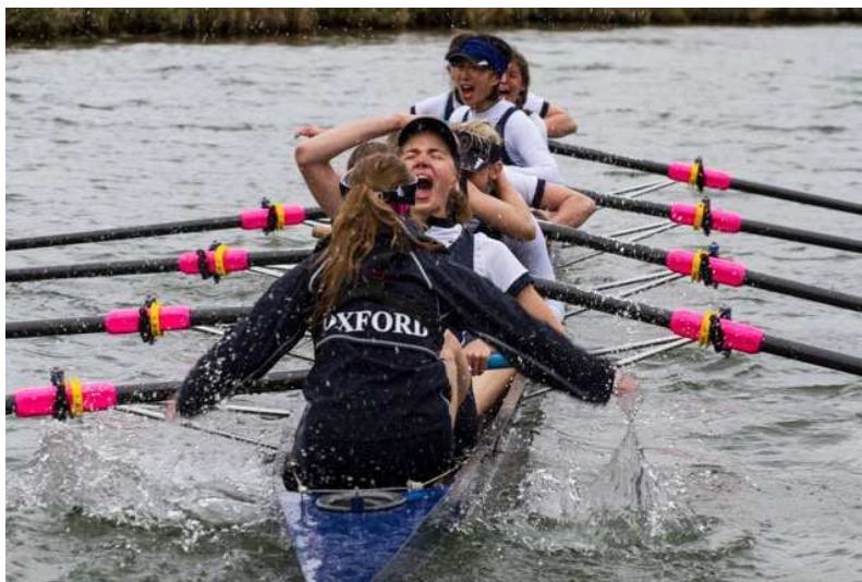
The Oxford Women's Lightweight crew

This race was followed by the Lightweight Women's Boat race. We were 3/4 of a length down as we passed Upper Thames, 800 m into the race; however, we managed to keep contact and eventually break the Cambridge crew at Fawley Court with 750 m to go. Following this, both boats battled it out neck and neck before Oxford crossed the line a canvas ahead to avenge the 2015 result and take the trophy home. A Blue Boat/Tethys composite subsequently went to the British University Championships last weekend and we took home a silver medal in the Championship Lightweight VIII category.