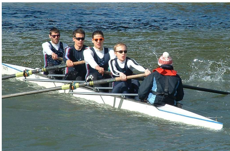
Catz Men's IV racing in City Bumps