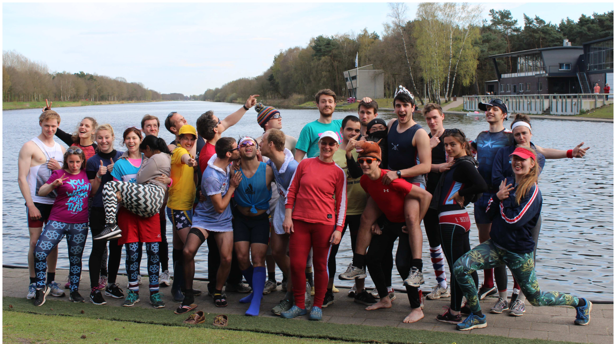
The Boat Club Easter training camp in Tilburg, Netherlands. Apparently some rowing also took place.