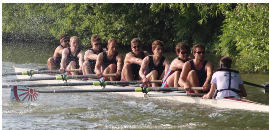
The Men's 1st Eight