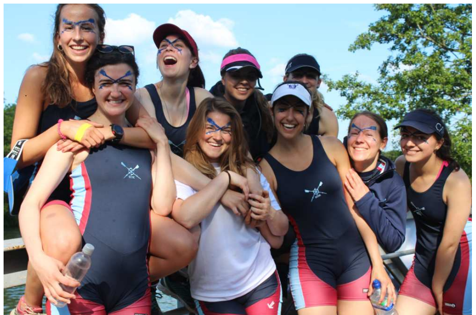
The Women's 1st Eight, very much enjoying their week

Looking forward to next year, things are looking up for Catz. With the momentum of a successful Summer Eights campaign, enthusiasm within the Boat Club is high and everyone seems excited to get back on the water as soon as possible. With new members and old faces I can only say: watch this space.