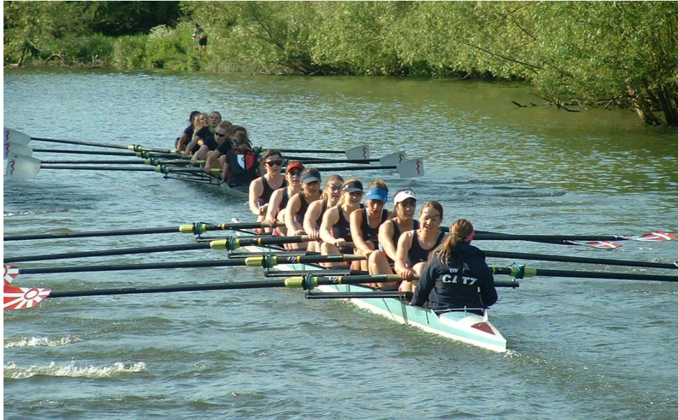
The Women's 1st Eight closing on Osler House