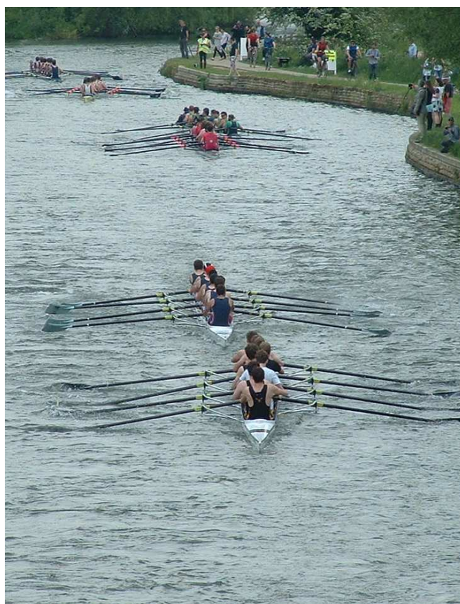
(Bottom) The men's 2nd Eight closing on Brasenose II.