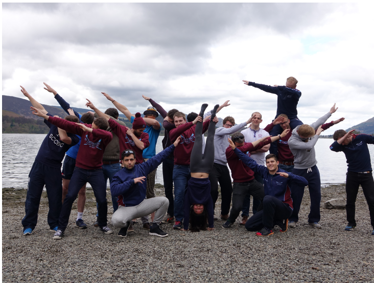
... When all at once I saw a crowd, A host of . . . oh, just some Catz oarsmen on their Easter training camp in the Lake District.

The girls have been quiet since Torpids but the boys have been busy: a couple of VIIIs went to an Easter training camp at Keswick (there's some nice video on the 'catzboatclub' instagram account of two Catz VIIIs hammering it out side-by-side along Derwentwater). At the start of term a mostly-Catz crew raced in the BUCS (British Universities) regatta masquerading, not for the first time, as 'Oxford University' — apparently the entry system didn't recognise 'St Catherine's College'. We have the prospects for Eights.