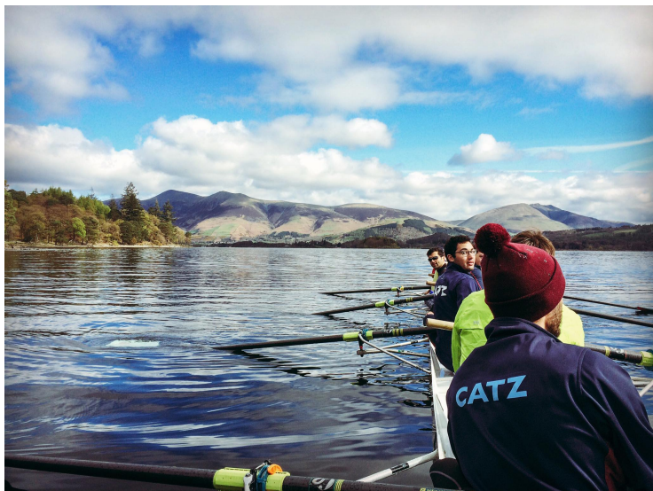
Easter training on Derwentwater

Last year the Men's 1st Eight rowed the course 8 times as the Sandwich boat, very closely pursued on the last day by L.M.H. and then putting Hertford under pressure at the bottom of Div I. This year's crew is quicker — little changed from the crew which finished 4th on the river in Torpids — and they'll be very disappointed if they're not firmly re-established in Div I by the end of the week. However, unless Magdalen fail to enter again (as they did for Torpids) Catz will first have to defend their position at the top of Div II by keeping clear of L.M.H., which, barring