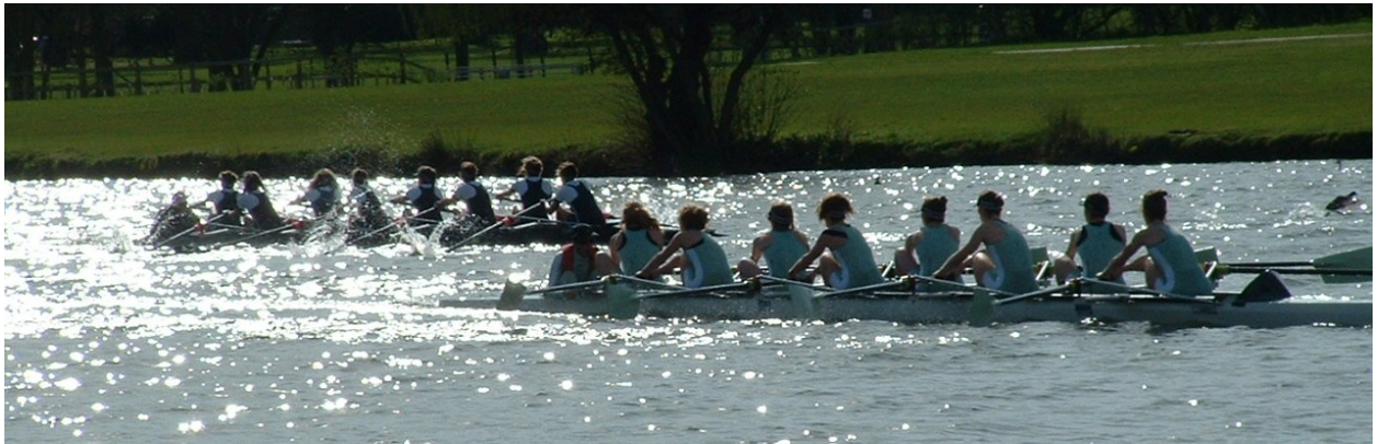
The Cambridge women's lightweights leading Oxford at the Henley Boat Races