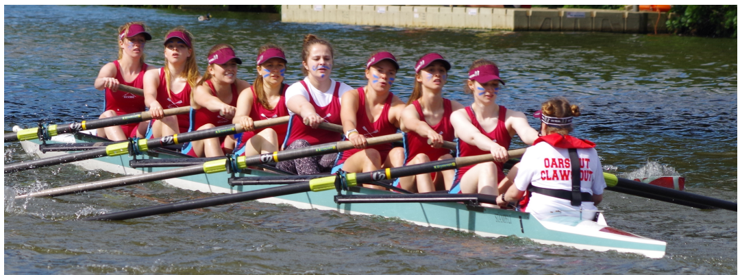
The Women's 1st Eight on the Saturday

Dispatching a long list of crews and only once having to row beyond the Gut. With four bumps apiece it was two sets of blades for the trophy cabinet.