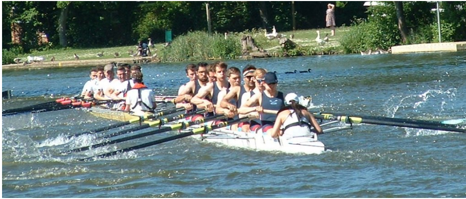
The Men's 2nd Eight closing on Magdalen II for their 3rd bump