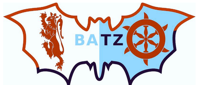
Logo of the Balliol/Catz Henley composite

29th 6:50.8 Jesus Coll (Oxf) Did not qualify