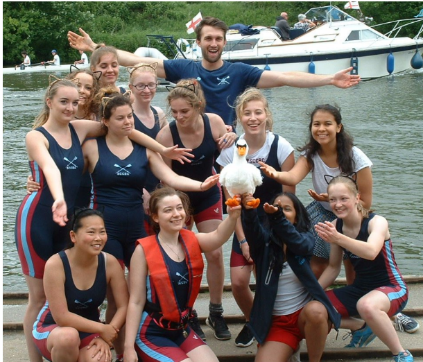
The Women's 2nd Eight 'collective'