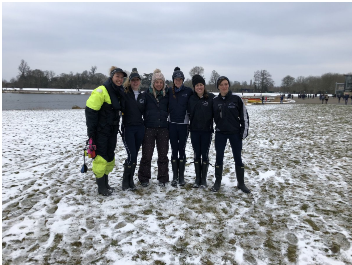
As Dorney Lake, twinned with Hell, is about to freeze over, the lightweight women's reserve crew provide the only glimmer of warmth for Oxford supporters

Finally we return to the present and consider the prospects for Summer Eights (yes, Summer — did someone not get the memo?) The men will be racing at Bedford next weekend, and then Eights is just a week and a half after that (23–26 May).