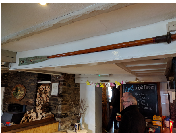
The Catz oar above the bar in The Tamar Inn, Calstock.