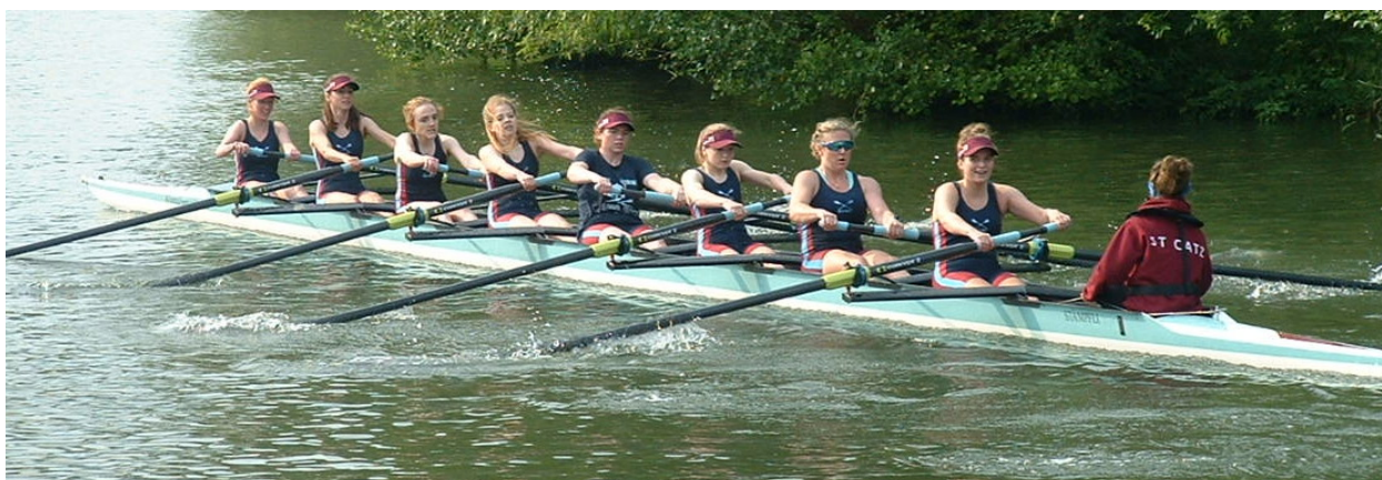
The women's 1st Eight rowing over on the Thursday