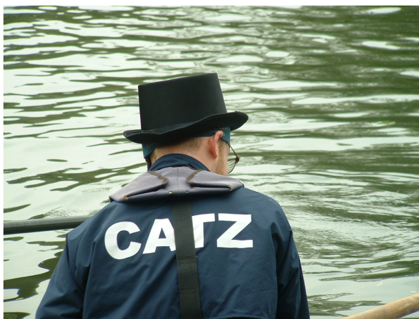
The suitably behatted cox of the gentlemen's 3rd VIII