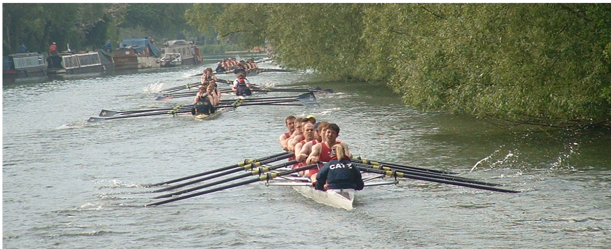
The men's 1st Eight in pursuit of Univ on the Thursday