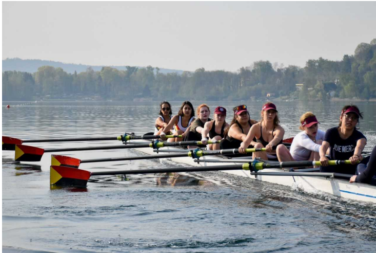
Catz Boat Club training on Lago di Monate