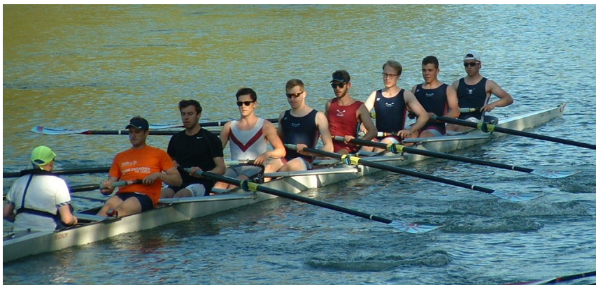
The Men's 1st Eight, with 4 and 5 in a 'tandem' or 'bucket' rig.

The women, on the other hand, have had to accommodate their two returning squad triallists, which has had the knock-on effect that two members of the 1st Torpid are now in the 2nd Eight (as G.T.C. II will not have appreciated when they took on Catz II for some bumping practice this afternoon). The women are focussing solely on Eights this term, with no plans to race anywhere else.