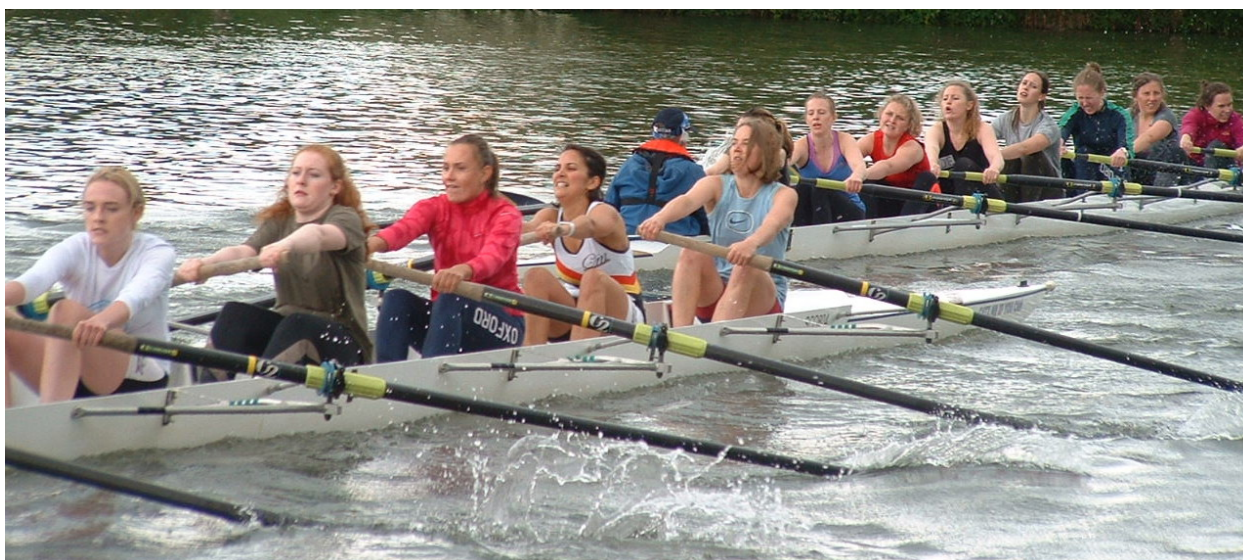
A rather scary-looking Catz W2 (foreground) getting in some bumps practice with G.T.C. II

The men's 1st Eight start behind Trinity, who had a good Torpids and, in theory, now have the services of a Blue, an Isis and a lightweight to call upon. Ahead of them are S.E.H., who are probably salivating over the prospect of Univ. for breakfast. Behind Catz are Jesus, whose steady rise since 2015 came to an abrupt end in Torpids, and there's no reason to suspect their Eight will be much faster. Magdalen are behind Jesus. Traditionally one of the major rowing colleges, they still haven't recovered from their implosion of 2017 and will probably fall to whoever emerges from the top of Div II. All of which should give Catz at least a couple of days to figure out who, if anyone, they're going to catch.