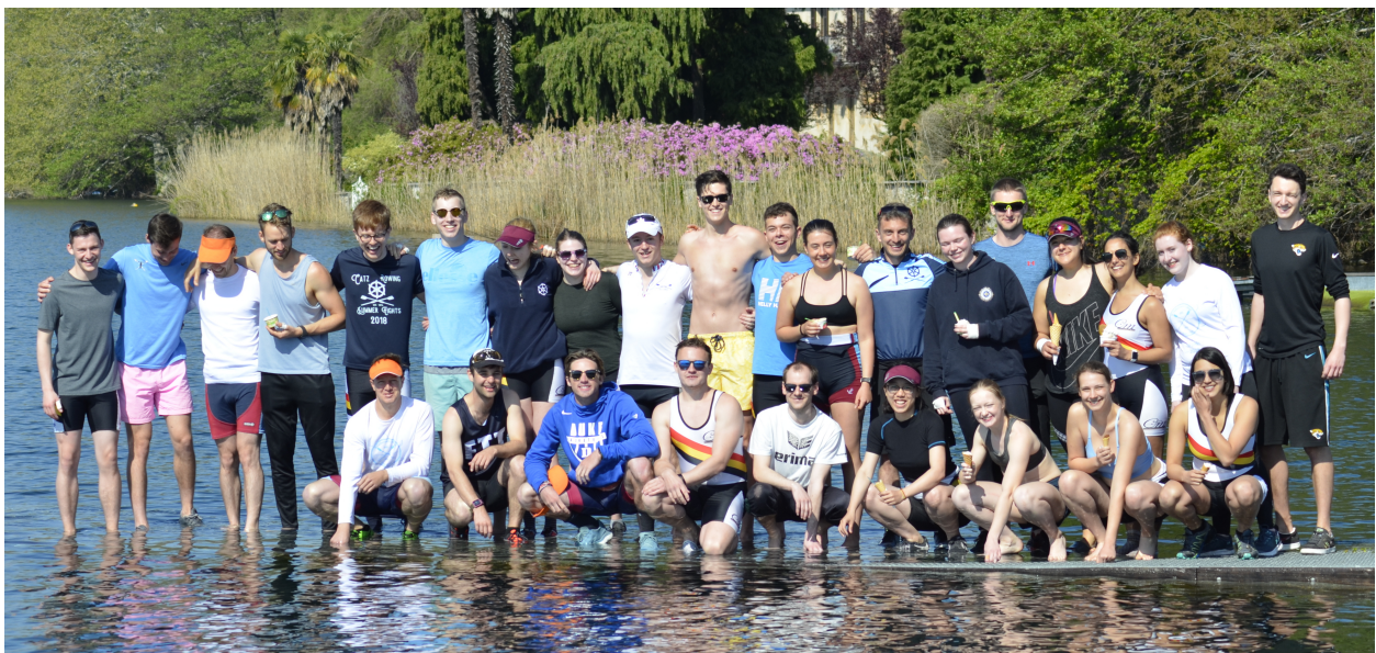
As the Boat Club gradually descends into Lago di Monate ... Hmm, maybe one can have too much pasta?