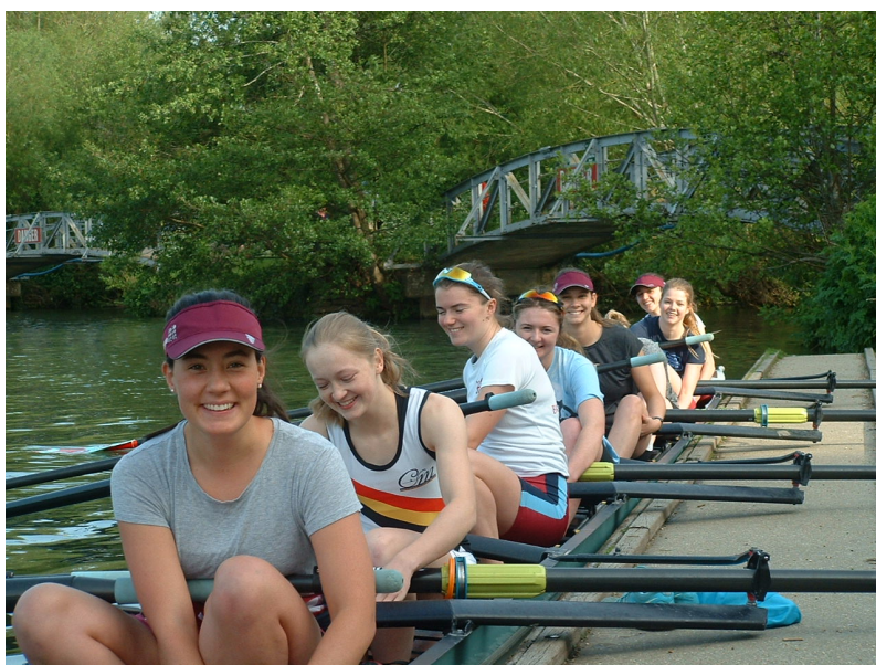
The not-at-all scary (honest!) Women's 1st Eight

I'll be down at the boathouse maintaining the 'Racedesk Live' web-site, and sending out evening reports as usual to those on the RS mailing list.