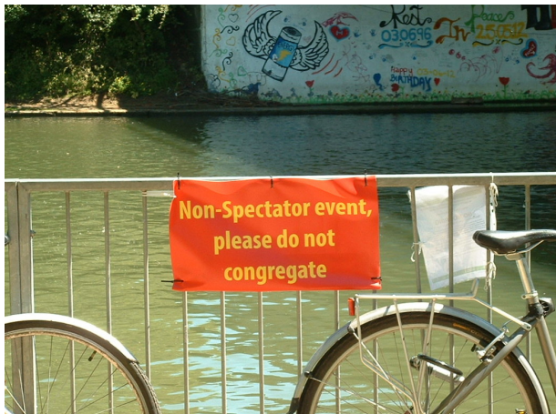
Move along now — nothing to see here. OURCs attempt to discourage spectators during 'Summer Torpids'.

An unusually long term's rowing finished with a Boat Club Dinner, at which the winner of this year's Ben Sylvester Award was announced.