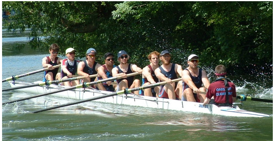
The Men's 2nd Torpid