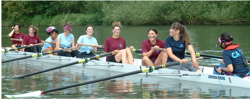
The Women's 2nd Torpid