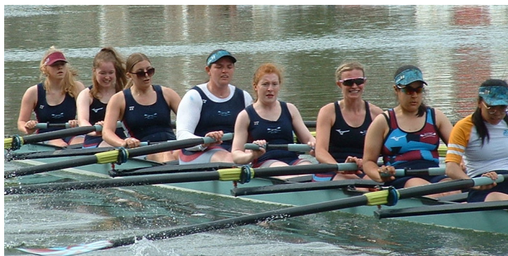
The Women's 1st Torpid

The lack of a Wadham entry had two immediate impacts on St Catherine's. Firstly, it meant that our women's 1st Torpid is now the only crew to have contested every Torpids since women's divisions were introduced in 1978. Secondly, it meant our men were promoted from 4th to 3rd on the river, their highest position ever in Eights or Torpids. Of course, the women had only to turn up to defend their new-won status; the men would have to fight to keep theirs.