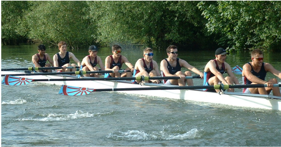
The Men's 1st Torpid