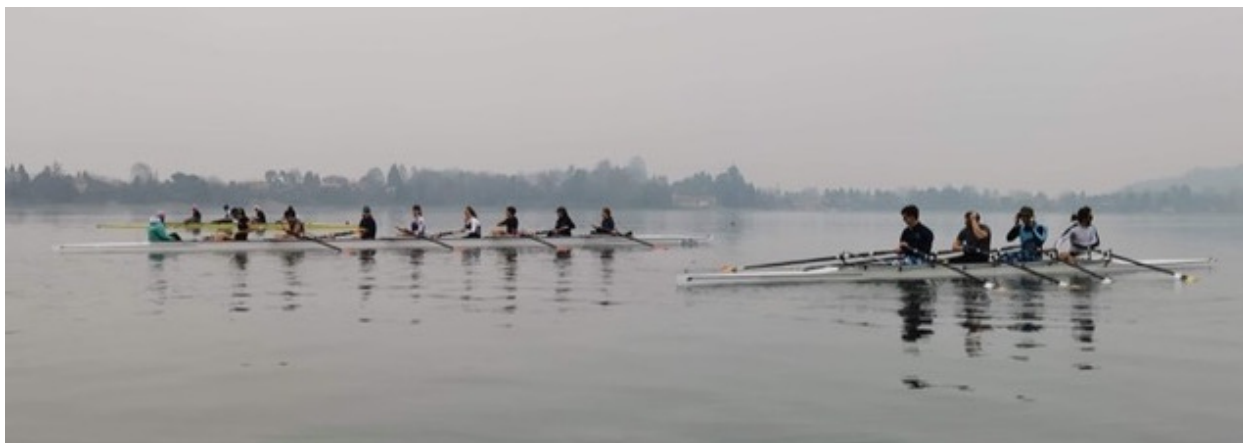
The Easter Training Camp at Lago di Monate in northern Italy