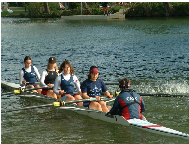
The Catz women's IV racing in City Bumps

Finally, on the all-time list of Catz competitors in bumping races, we now reach those on 40 starts or more: a venerable group of gentlemen occupying places 10–13.