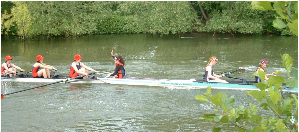
Yep, that'll do. The women's 1st Eight complete a successful week with a bump on Balliol.

Catz III are now the highest men's 3rd Eight on the river.