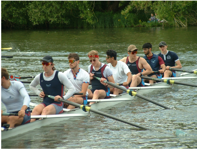
The men's 1st Eight pushing off on the Saturday

being unlucky with the draw and the speed of crews ahead. M2 ended up moving down a couple spots, being surrounded by some speedy crews and even having a klaxon in one of their days. Finally, our M3, a rag-tag combination of dedicated athletes and alumni, managed to snag blades by bumping every single day without making it to Longbridges. With this they also got M3 headship and match GTC W1 for the most consecutive bumps [14 days]. Everyone should be proud of how they did, with this being the culmination of a whole year's worth of training and dedication. Our time as captains has now come to an end, but we couldn't be happier with the performance of our squad, as well as the environment they created. We look forward to seeing how the next set of captains further progress our Boat Club.