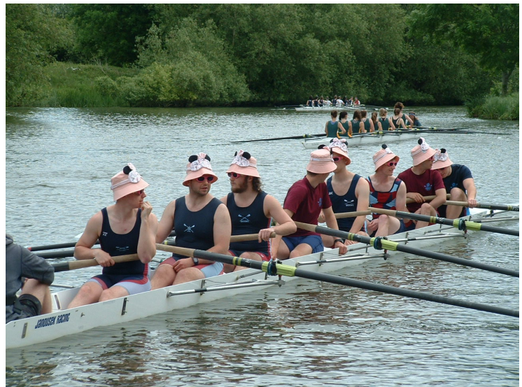
The men's 3rd Eight. 'Intimidating? Who — us?'

As captains, our goals were to simply move up in the rankings for all boats, with the aim to also have an M3 qualify, which they did in Rowing On. During the event, our M1 moved up one place,