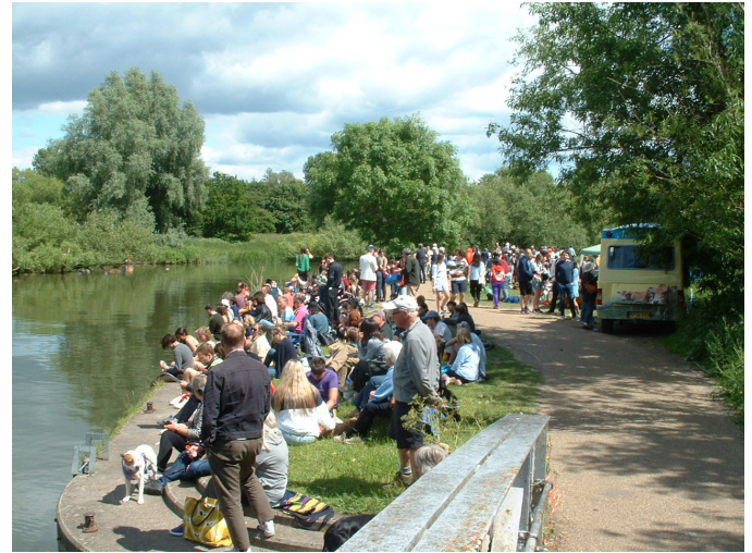
Spectators, and ice cream van, in the Gut on the Saturday