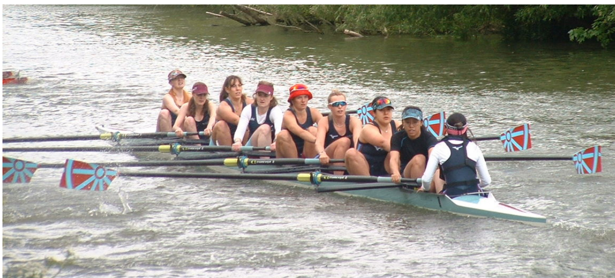
The women's 1st Eight racing on the Wednesday

by St Edmund Hall W2. Our W1 had a very successful campaign for Summer Eights this year, bumping Somerville, Linacre, St John's, and Balliol, which meant blades!