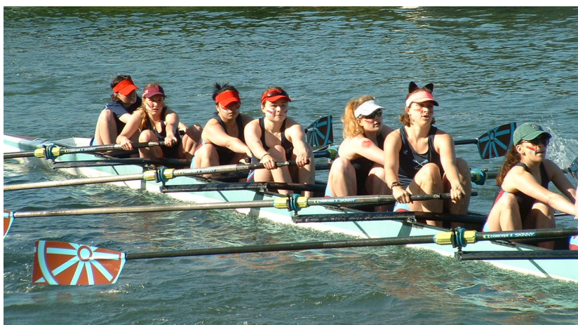
The Women's 1st Eight, on the Friday