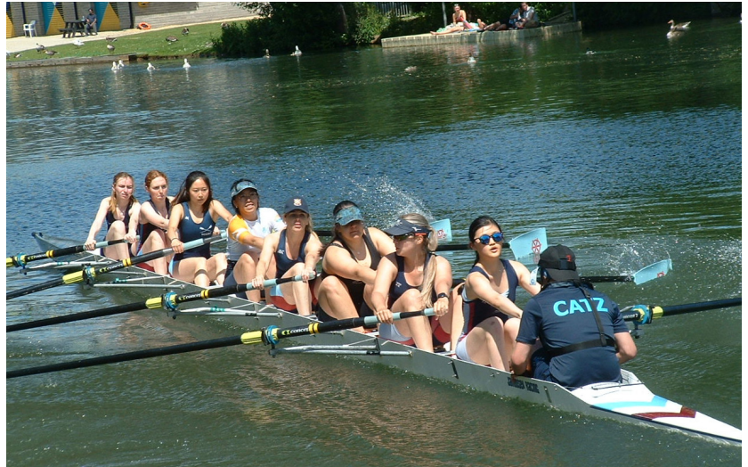
The Women's 2nd Eight, on the Friday (having got clear of the bank)