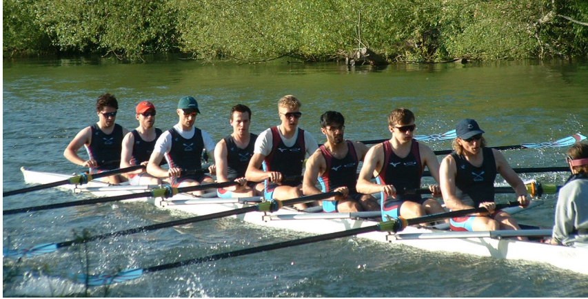
The Men's 1st Eight, on the Friday

on the racing line to inconveniently placed swans. Despite this, a crew with a slightly rotating cast due to exam commitments put together 4 good rows, was never really in danger of getting bumped, and benefitted from a penalty bump on Jesus on the Wednesday to finish the week one bunghline higher than we started.