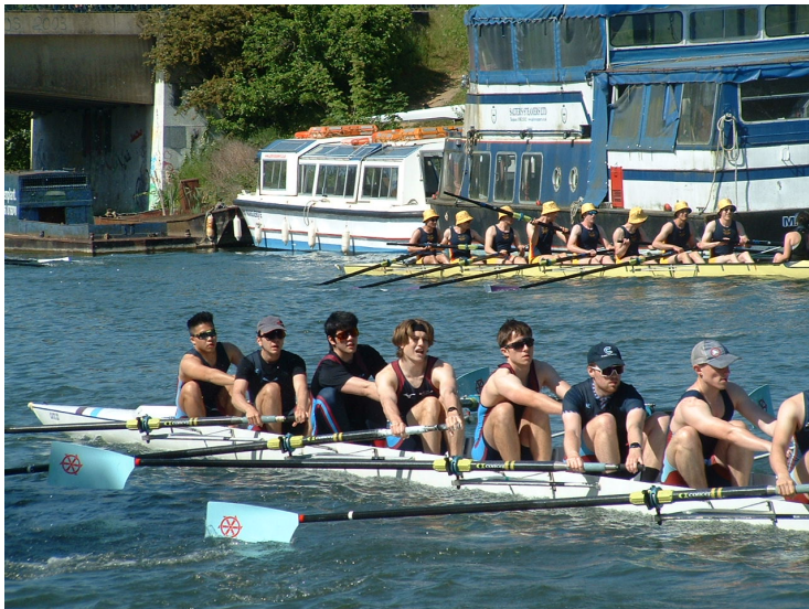
The Men's 2nd Eight, on the Friday