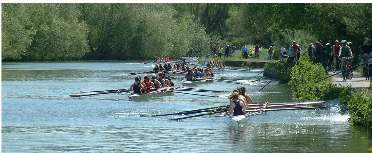
Catz Women's 2nd Eight, starting head of Div VI on the Friday, having some difficulties getting away from the bank. Surprisingly this turned out to be the first of only three occasions this week when a Catz crew reached the finish line.