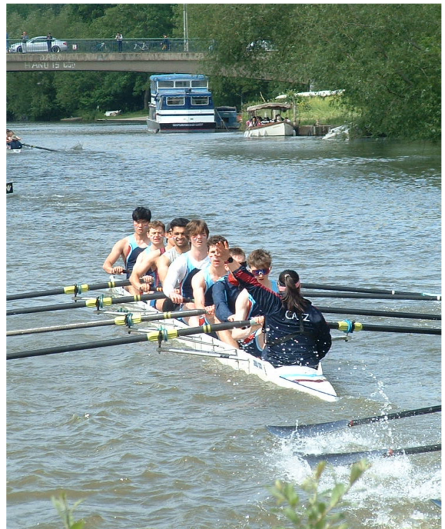
The Men's 2nd Eight conceding early to Brasenose II on the Thursday (having had to switch boats at the last minute).

four days. Both teams showcased their unwavering commitment to the sport and to each other. M2 especially represent a strong future cohort which we're confident will set a sturdy foundation on which the club can build in years to come.