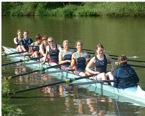
The Women's Eight at the start on the Friday