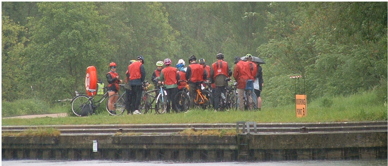
A huddle of umpires as Summer Eights gets off to a soggy start