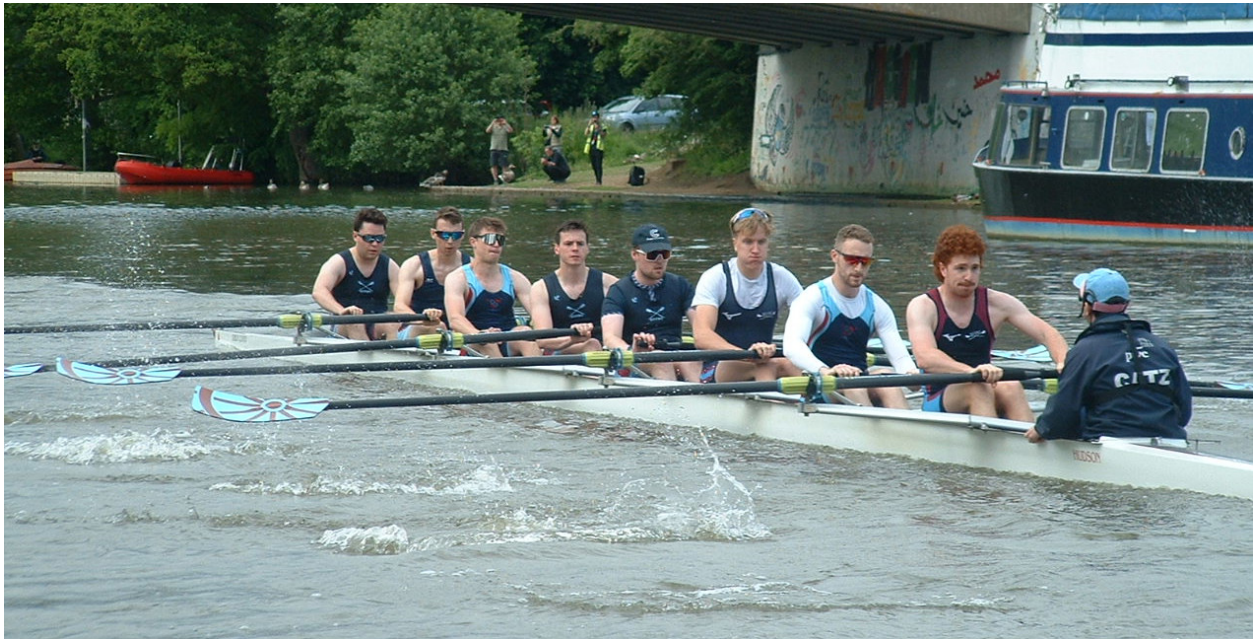
The Men's 1st Eight on the Friday