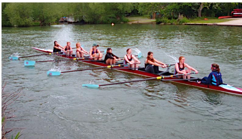
The Women's A crew (2nd VIII-ish) racing in the ISL.