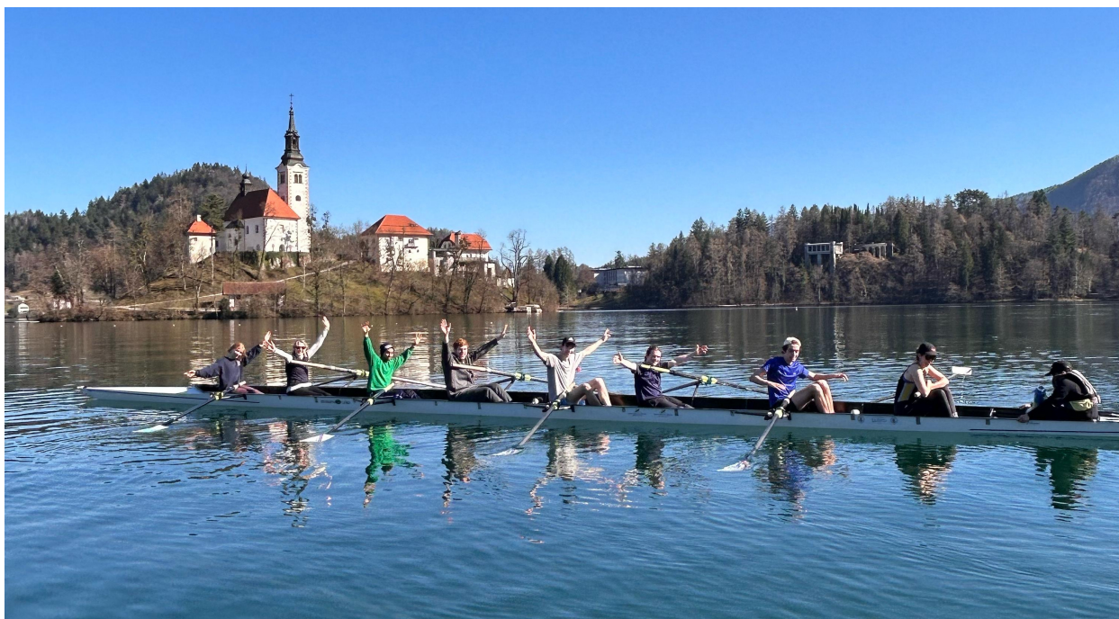
Easter training camp on Lake Bled in Slovenia