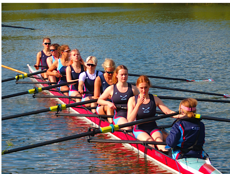
The Women's 1st Eight

This past term was an intense one for the women's side. Many of our rowers participated in the Sculling Camp, gaining valuable experience in smaller boats such as the single and double sculls. We also competed in the ISL, where we placed third overall with a time of 5:14.5 — just behind Lincoln, who finished first with a time of 5:07.5.