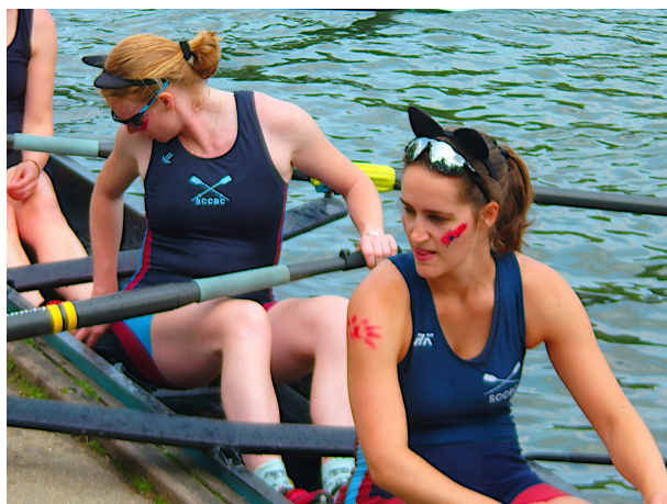
The Women's 2nd Eight boating on the Saturday.