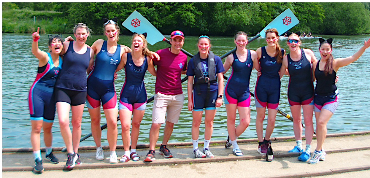
The Women's 2nd Eight