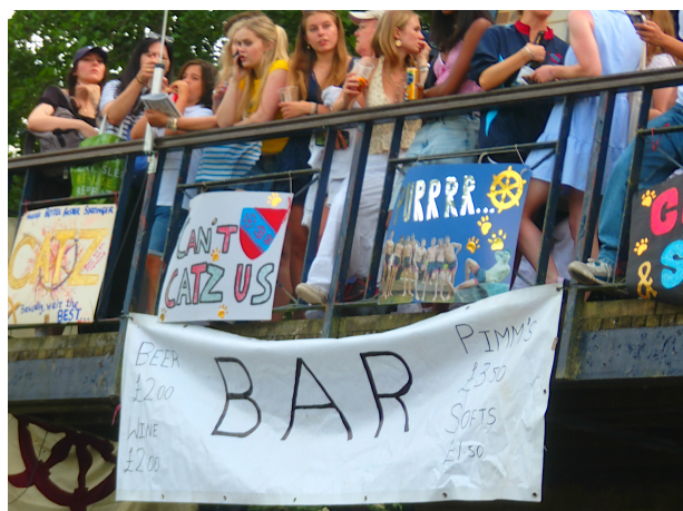
The Boathouse Balcony on the Saturday. The bar prices displayed on the banner were probably accurate. The sign saying 'Can't Catz Us', maybe less so.