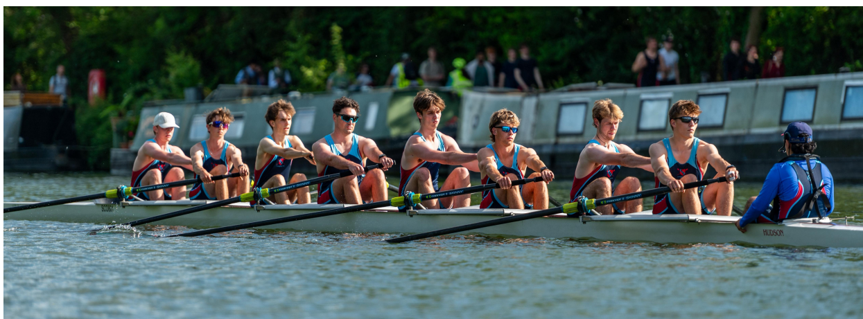
The Men's 1st Eight

crew selections for Eights and once these were decided we squeezed in as many outings as possible around revision and exams.